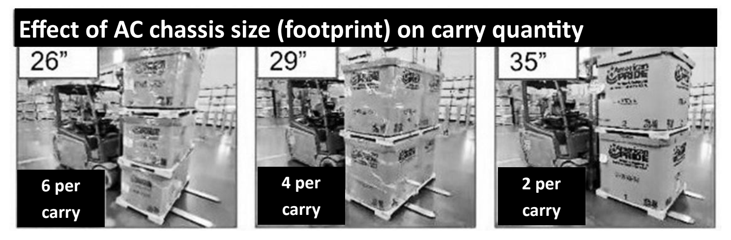
Larger AC Units as a Result of the 2023 Mandate will Increase Handling, Storage, & Freight Costs